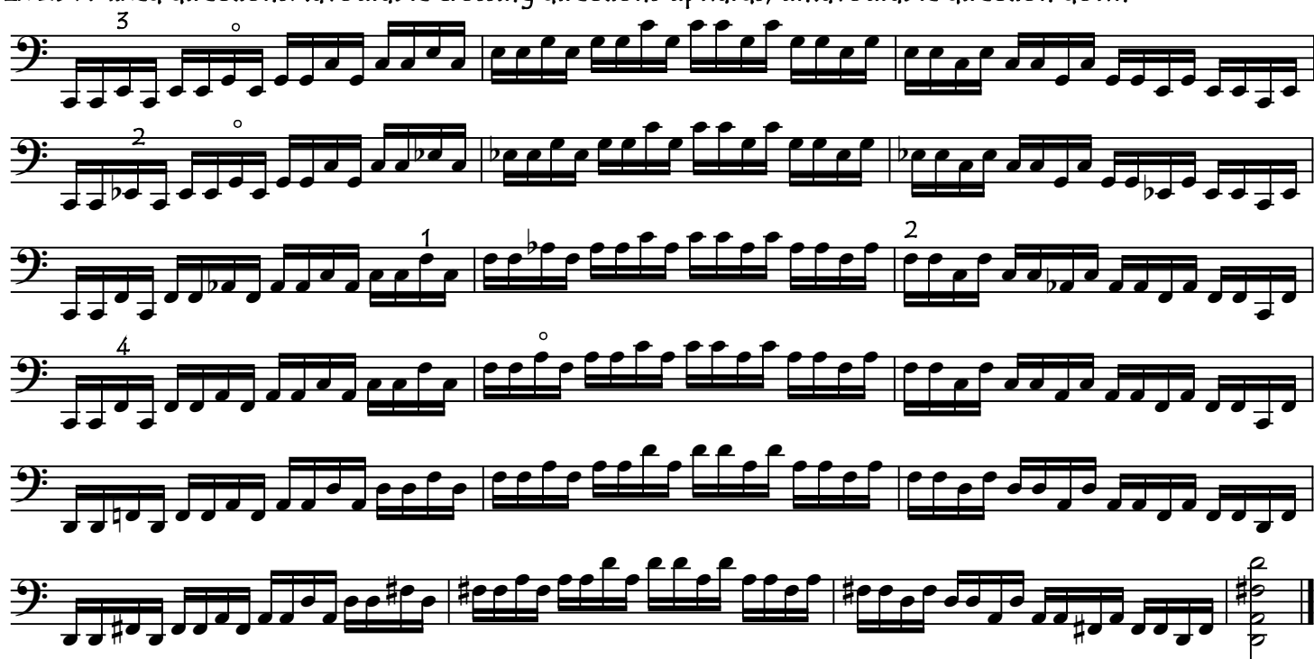
Ex 2E: Mixed directions going up, favourable coming down