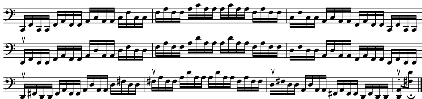
Ex 2D: Mixed directions: favourable crossing directions upwards, unfavourable direction down