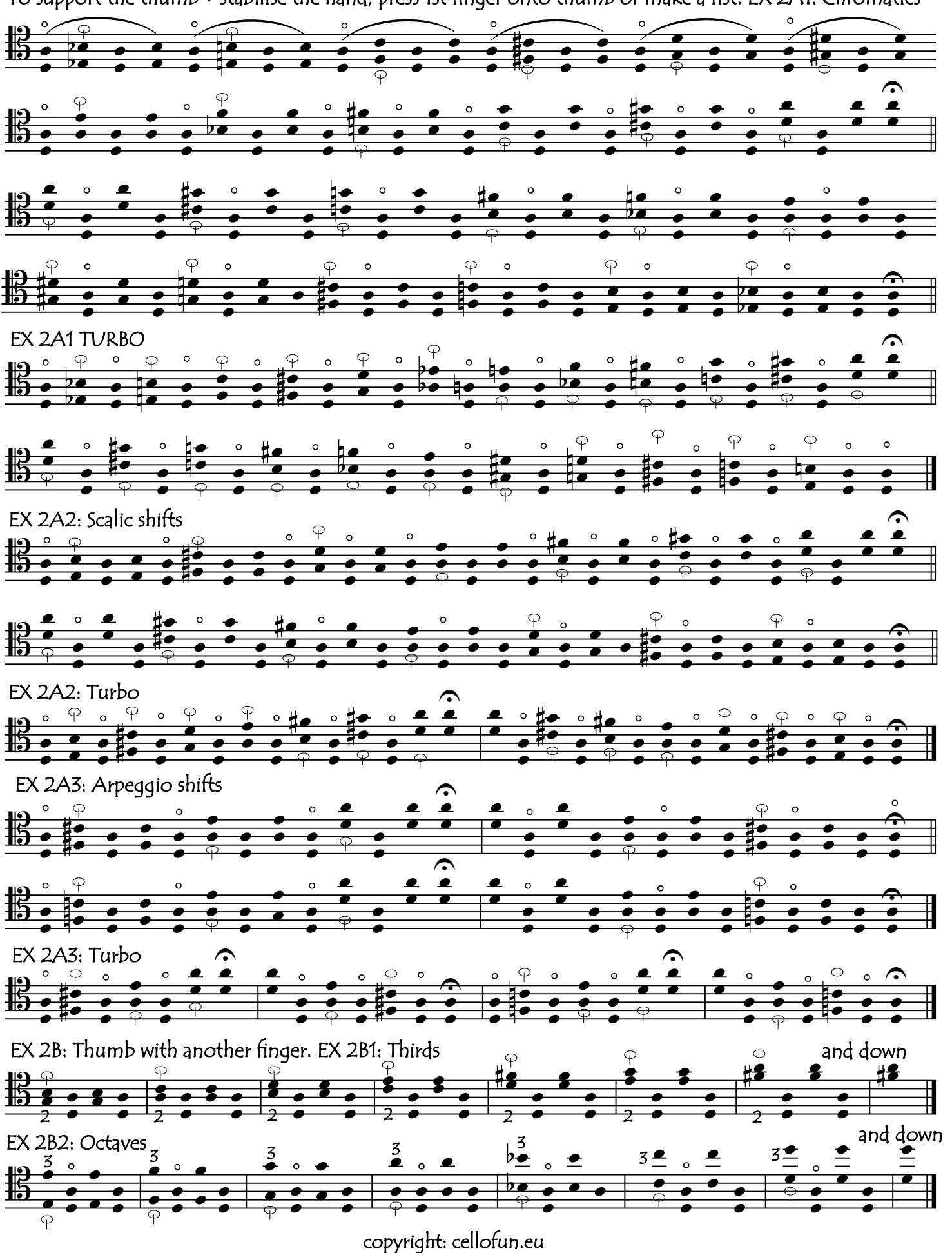
PART 2: Thumb placed from mid-air (with no other held fingers for positional reference). To support the thumb + stabilise the hand, press 1st finger onto thumb or make a fist. EX 2A1: Chromatics